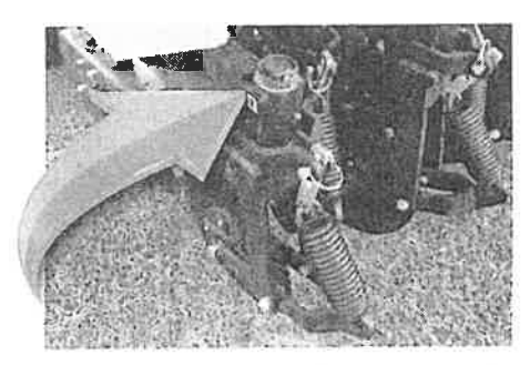
Pull this pin on each row to remove no-till coulter assembly. This converts drill from no-till to conventional.