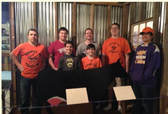
Boy Scout Troop #78 and Short Bessie